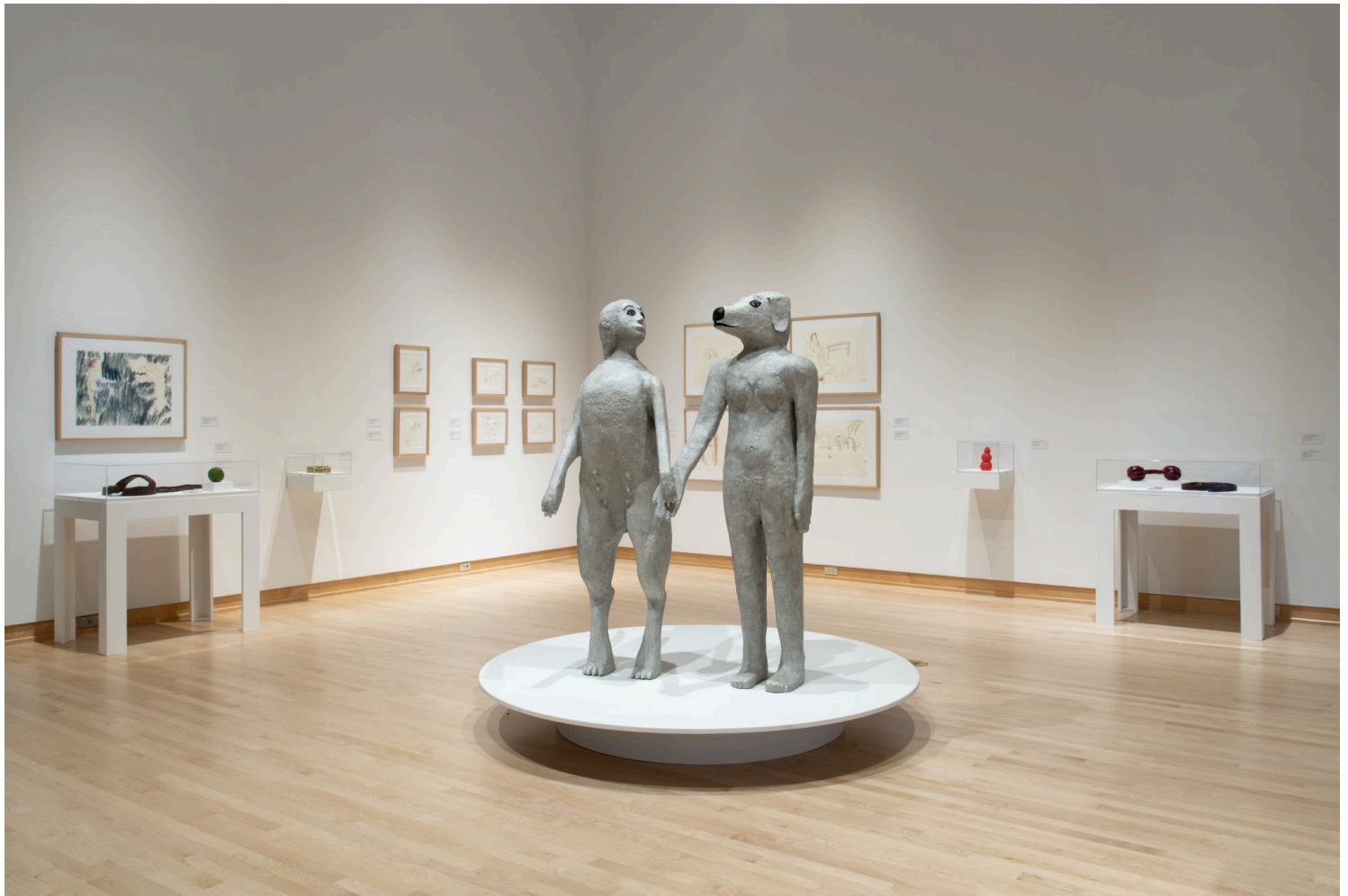
True Love Will Find You in the End, 2021 (installation view, Sharing the Same Breath, 2023, John Michael Kohler Art Center, Sheboygan, WI).