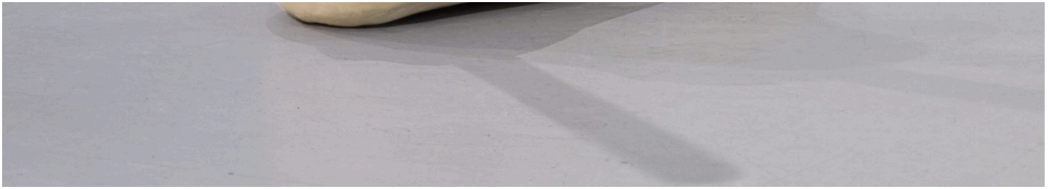
Outerspace , 2019 (installation view, Memory of a Body , 2019, Green Hall Gallery, New Haven).