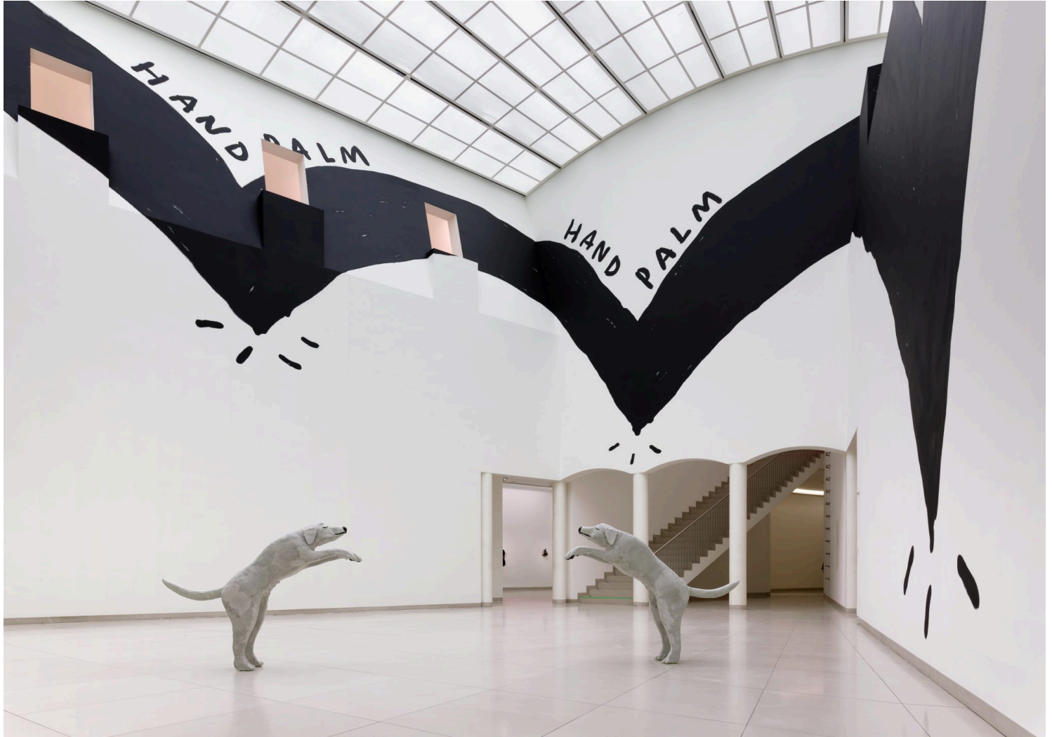
Emilie L. Gossiaux, Dancing with London , 2021 (installation view, Crip Time , 2021, Museum für Moderne Kunst, Frankfurt).

Emily McDermott Features 06 December 2023 ArtReview