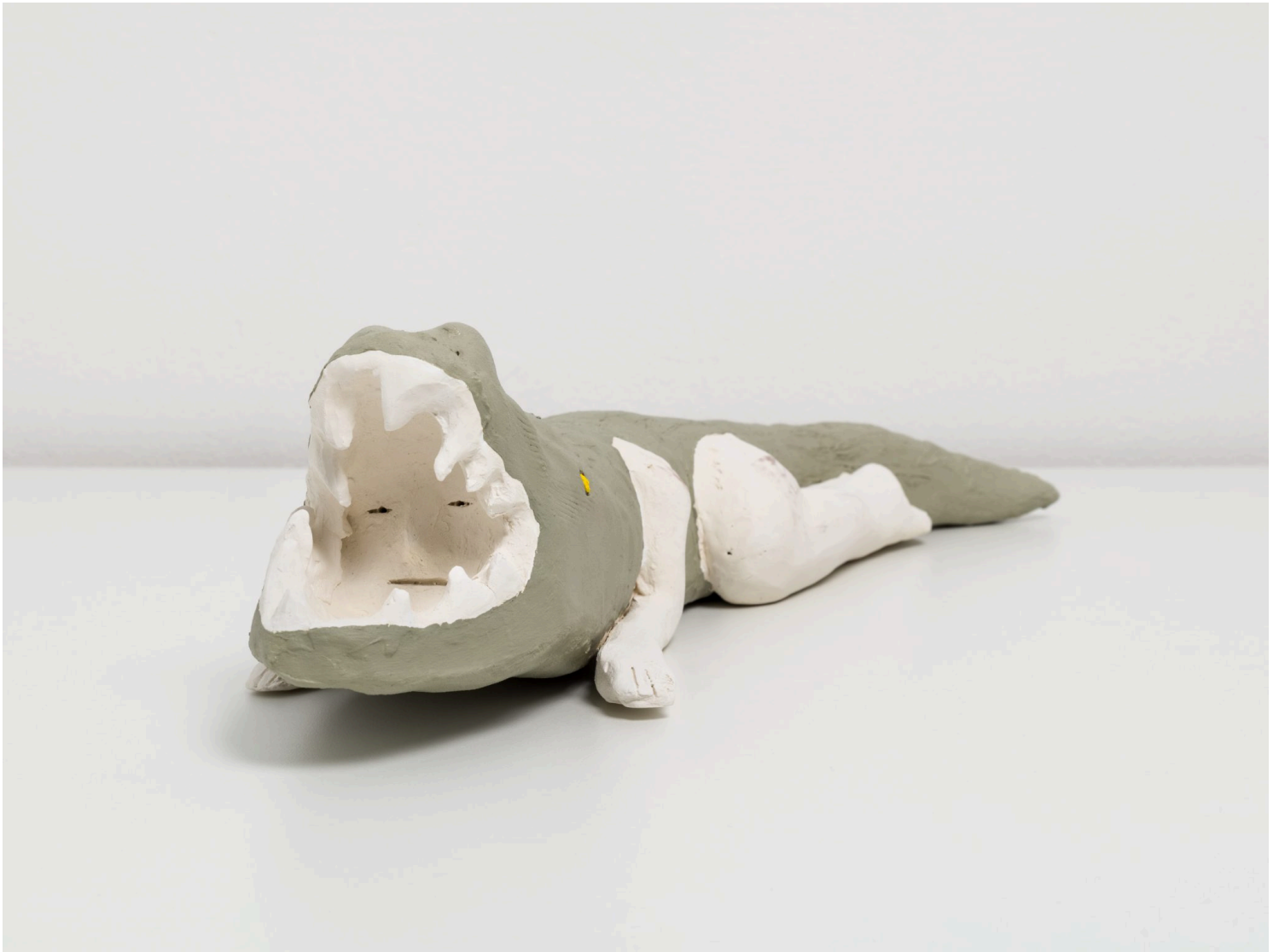
Alligatorgirl , 2022 (installation view, Significant Otherness , 2022, Mother Gallery, Beacon, NY). Courtesy the artist